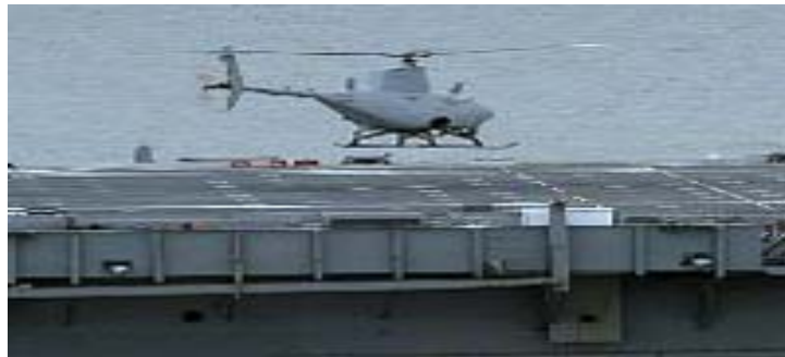
Figure 3. RQ-8A Fire Scout lands aboard USS Nashville 5

It is from this basic, yet proven platform that the RQ-8B Fire Scout VTUAV was developed. The Fire Scout is powered by a derated version of the proven Rolls-Royce Allison 250C20 turboshaft engine. While capable of producing 315KW (420 Shaft Horsepower (shp)), the engine has been governed to produce just 175KW (235shp) for takeoff and 165KW (220shp) for max continuous operation driving a three blade main rotor and two blade tail rotor. Derating the engine increases the performance of the aircraft at higher altitudes and higher than standard (59 degrees Fahrenheit) temperatures. Furthermore, by derating the engine, fuel burn rate is decreased and both on-station time and maintenance intervals are increased. Under testing, the power plant was able to develop maximum rated output power from sea level to the lower level of class Alpha Airspace at 18,000 feet. As opposed to the majority of UAVs currently being used by the military which are fueled by 100 Octane Low Lead Aviation Gas (AVGAS), the Fire Scout was developed to run on Jet Propellant 5 and 8 (JP-5 and JP-8 jet fuel). Both fuels are a kerosene-based derivative of diesel fuel, which are relatively nonvolatile with a much higher flashpoint than commercial aviation turbine fuels and far safer than AVGAS for shipboard use. In addition, both fuels contain an icing inhibitor, corrosion inhibitor, lubricants and antistatic agents, making them ideal for prolonged operation in sometimes less than ideal conditions.